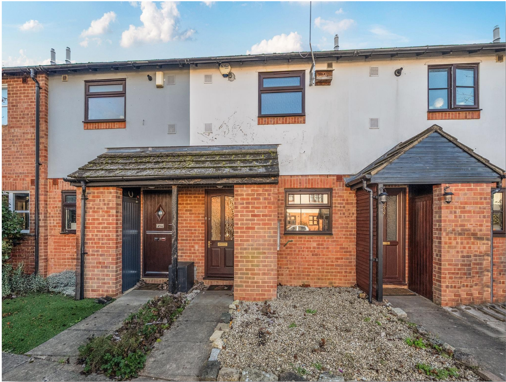
10 Savoy Court, Maidenhead SL6 7JS