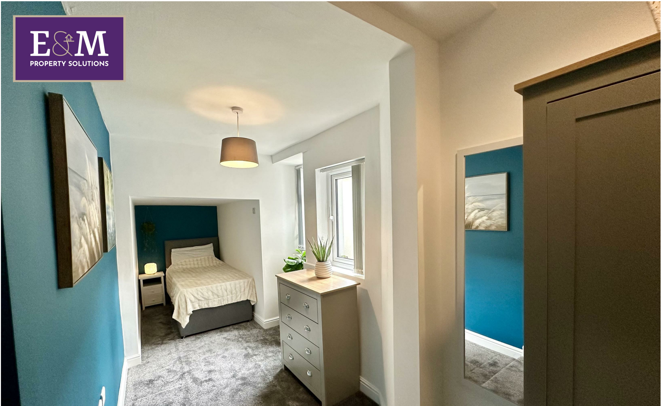
ROOM 2, 14 Lebanon Street, Burnley, Lancashire, BB10 4DF £90 Per week