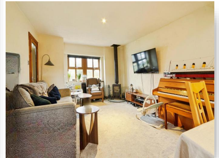
2 Hollin Hall Farm Long Causeway, Denholme Bradford BD13 4DX