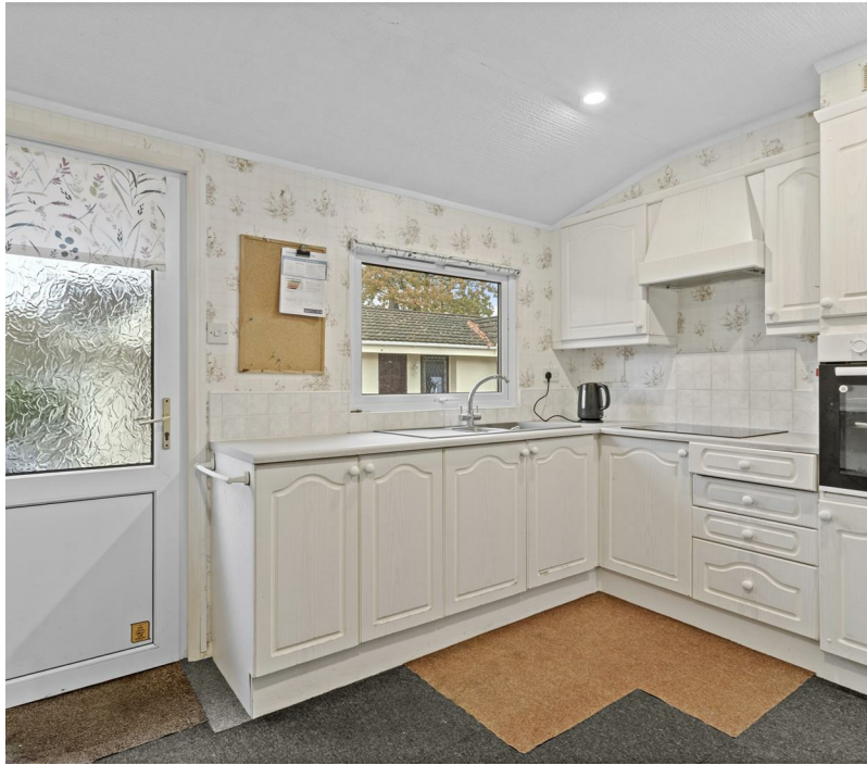
Deanland Wood Park, Hailsham