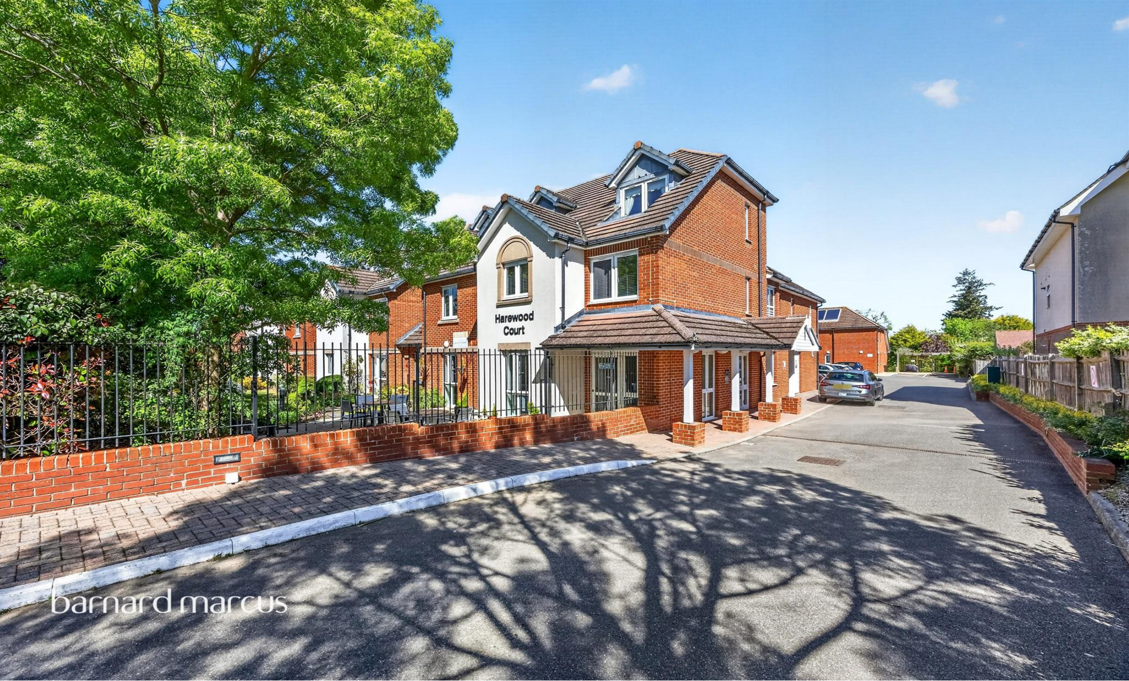
Harewood Court, Limpsfield Road, Warlingham CR6 9DX