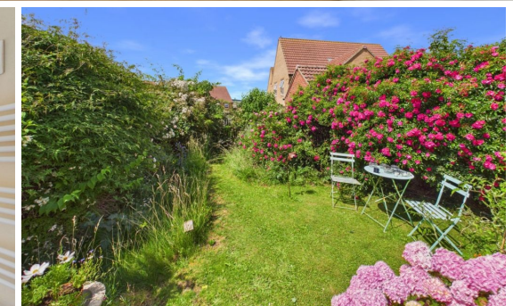
43 KINGFISHER DRIVE, WHITBY- 4 bed Detached House -£325,000