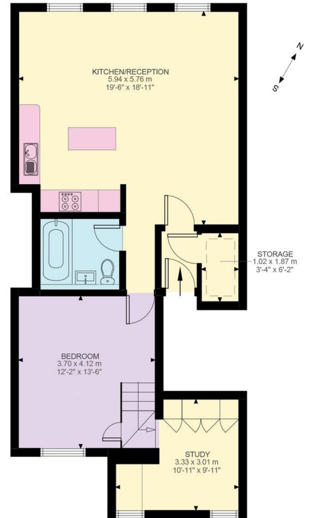
Second Floor 733 ft 2

Cornwall Gardens, SW7 Approximate Gross Internal Area = 68.12 sq m / 733 sq ft