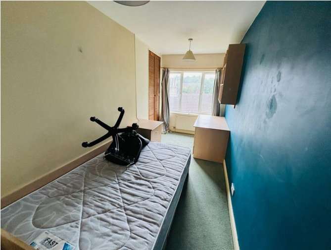
Good sized single bedroom - Double glazed window, central heating radiator