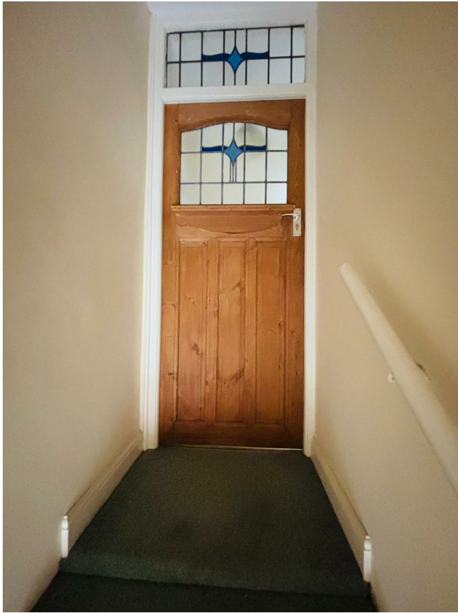
Stairs rising to the first floor