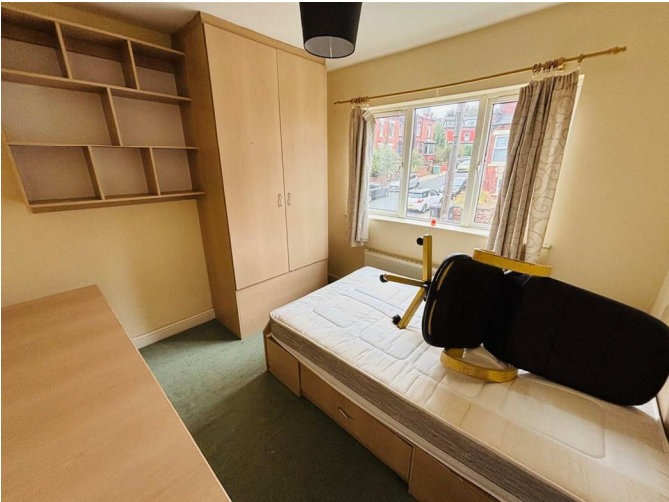
Double Bedroom - Double glazed window, central heating radiator, a range of fitted wardrobes / storage