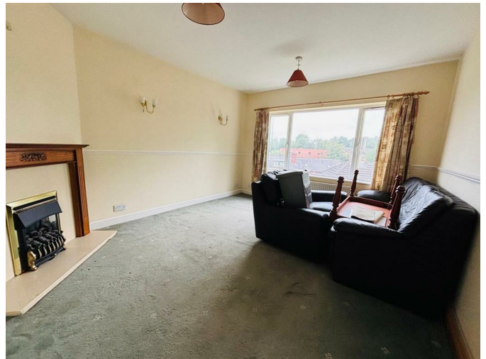
Double glazed window, central heating radiator, fireplace and hearth with an electric fire, wall lights, ample space for a range of living room and dining room furniture, central heating radiator