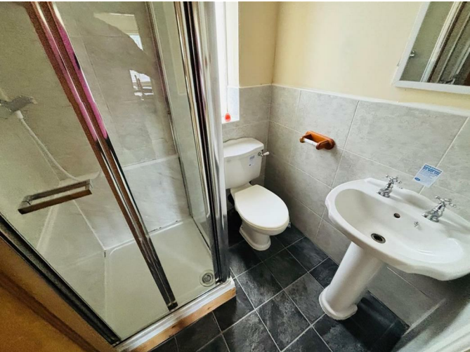
Double glazed window, a glazed shower cubicle with a shower, wash basin, low flush WC