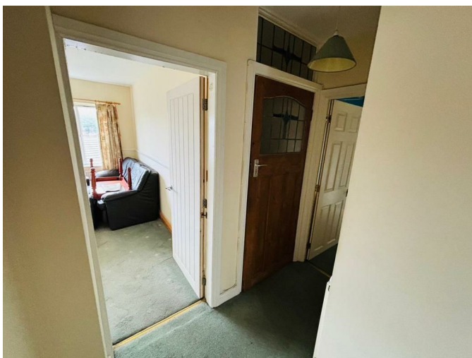
Access to the first floor accommodation