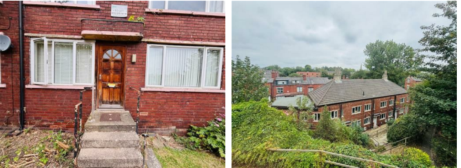
This property benefits from having access to a communal garden area