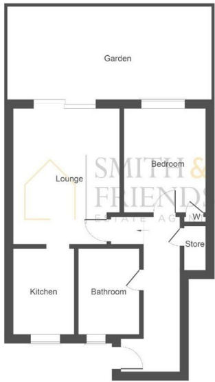
Not to Scale. Produced by The Plan Portal 2025 For Illustrative Purposes Only.