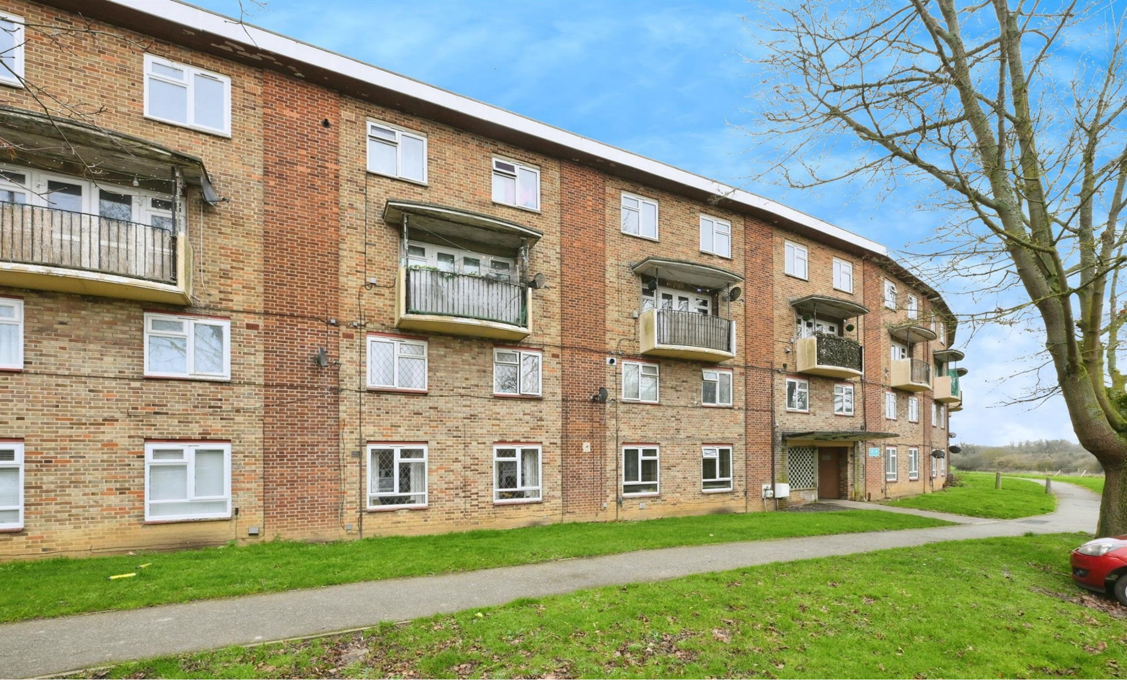
Quarry Spring, Harlow CM20 3HR