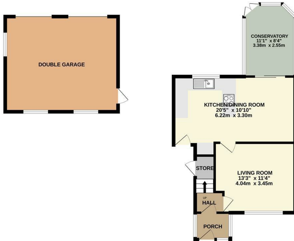
GROUND FLOOR 813 sq.ft. (75.6 sq.m.) approx.