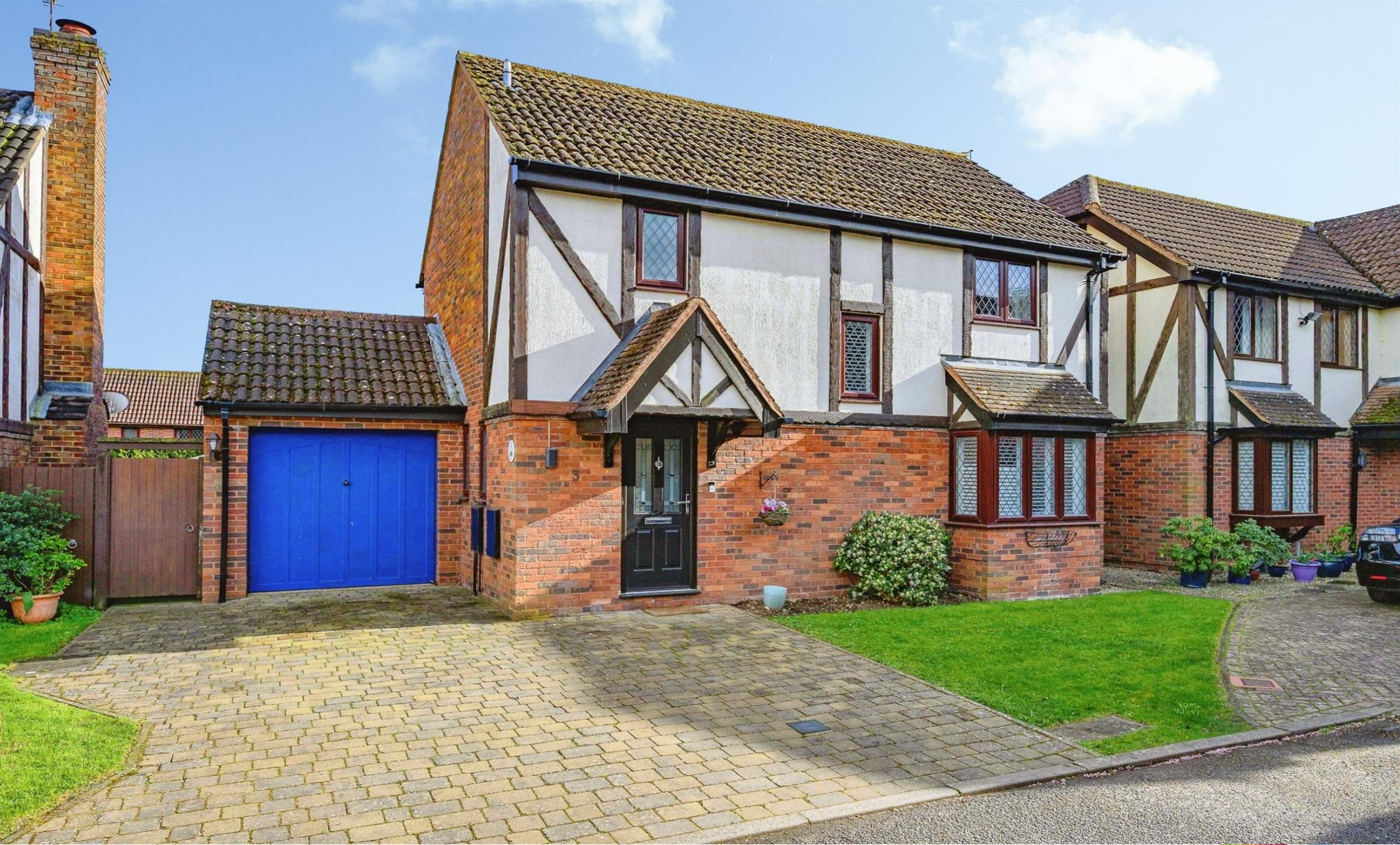
Squirrel Chase, Hemel Hempstead HP1 2TL