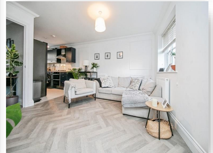
William Sims Close, West Bergholt, COLCHESTER, CO6 3FF