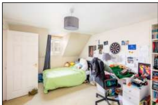
Second Floor Bedroom Three