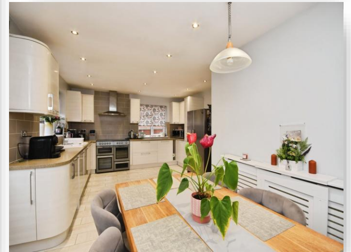
Recreation Ground, Sible Hedingham, Halstead, CO9 3JD