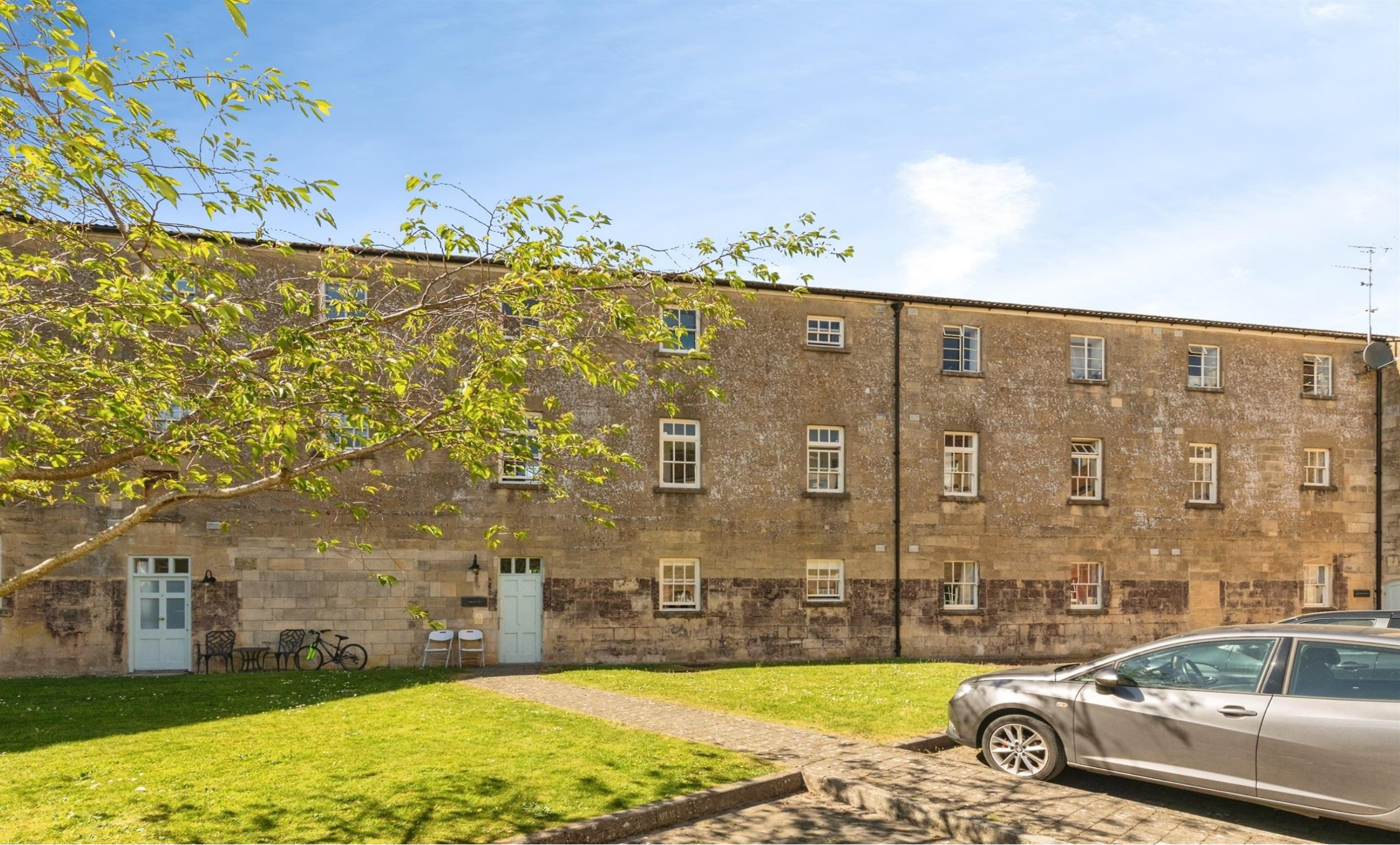
The Hexagon Kempthorne Lane, Bath BA2 5RS