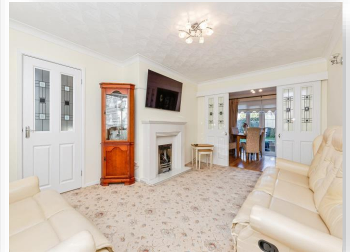
Roxby Close, Hartlepool TS25 2AL