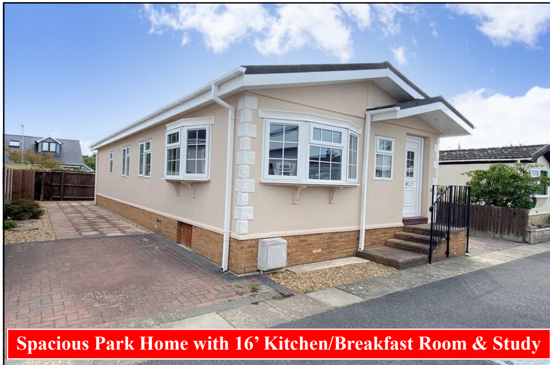
Spacious Park Home with 16' Kitchen/Breakfast Room & Study

26 Pilgrims Park, Poulner, Ringwood. BH24 1TQ