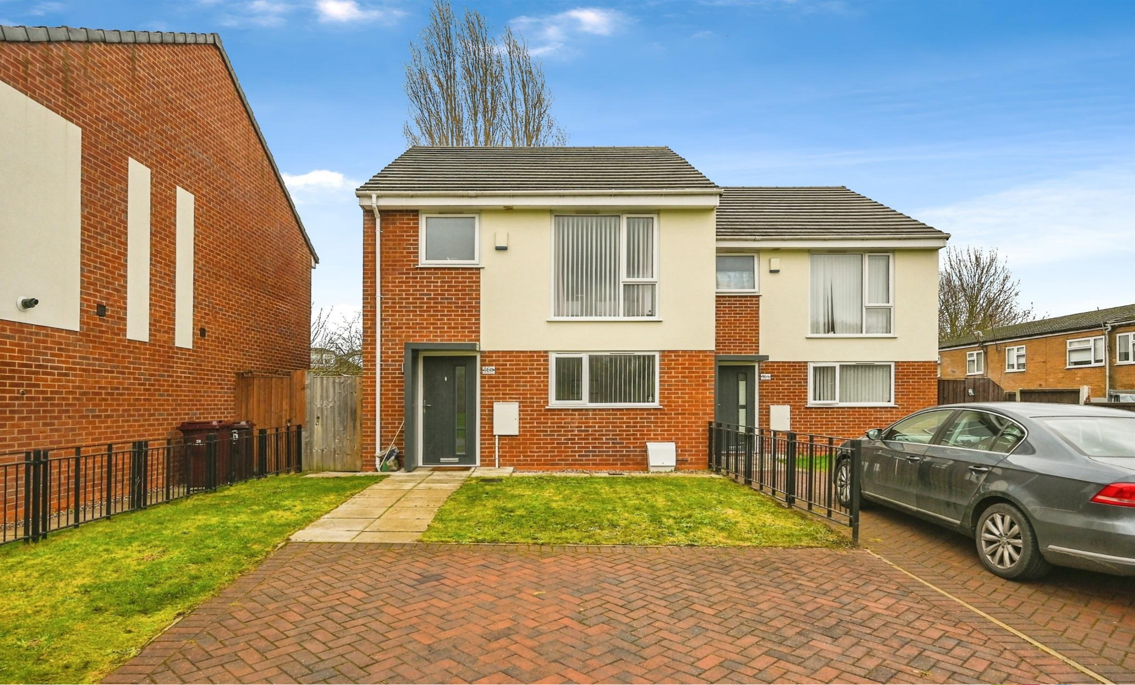
16b Maldon Close, Liverpool L26 9XL