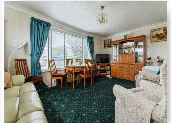
Oaklands Drive, Brandon IP27 0NR