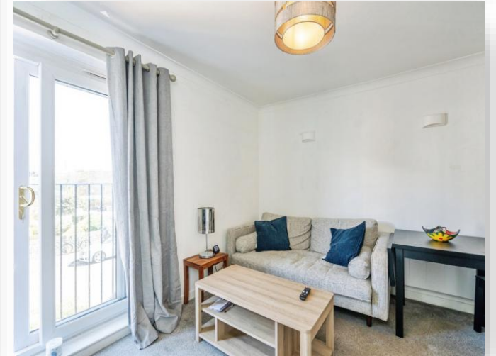
Flat 8 Campbell Road, Bognor Regis PO21 1NW