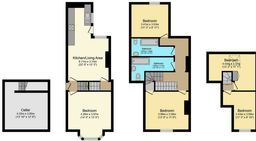
Cellar Floor area 17.5 sq.m. (188 sq.ft.)