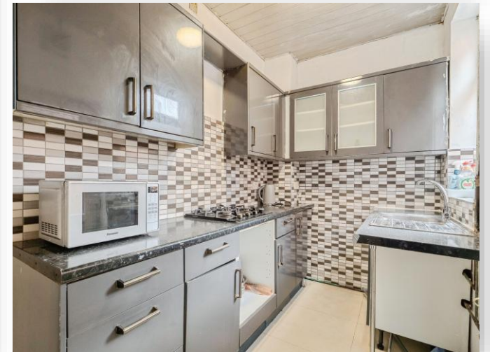
Stanhope Street, LEICESTER LE5 5EU