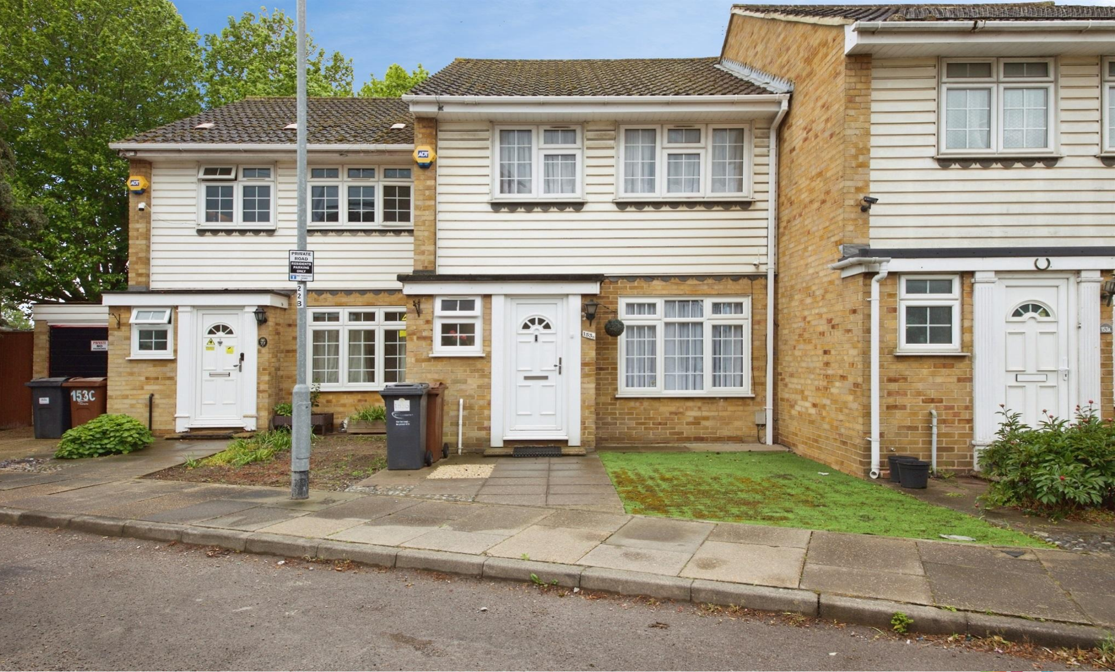
Wilmington Gardens, Barking, IG11 9TT