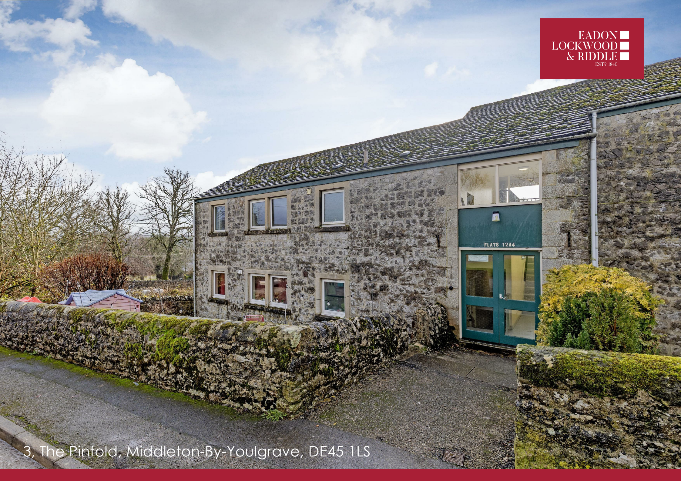
3, The Pinfold, Middleton-By-Youlgrave, DE45 1LS