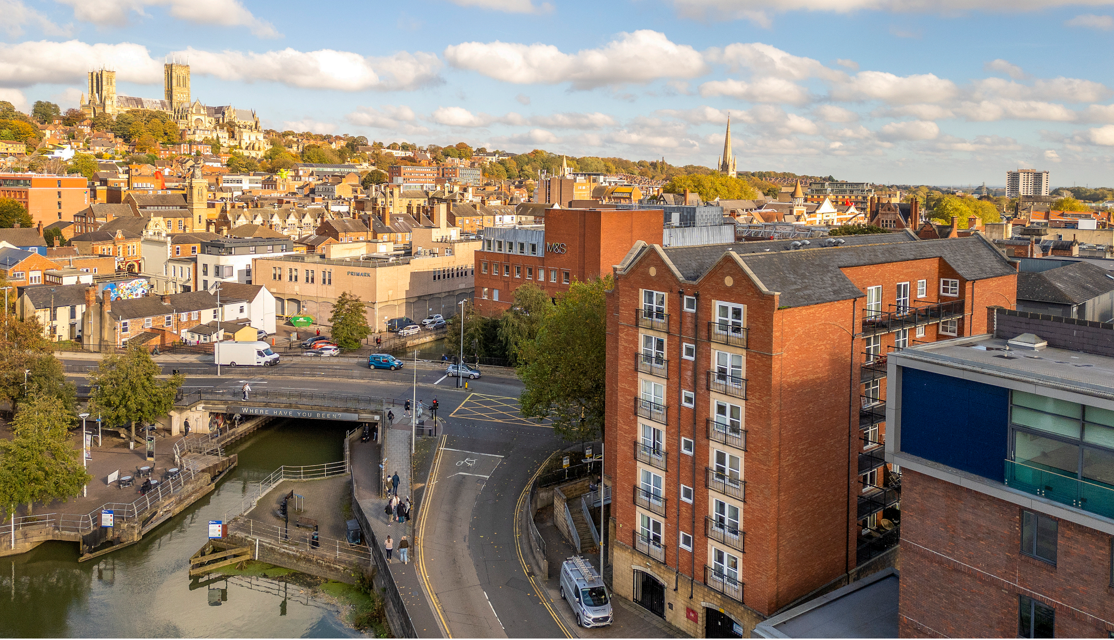
6 Grantavon House Lincoln