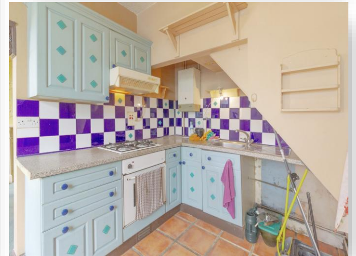
Melton Road, Thurmaston Leicester LE4 8ED