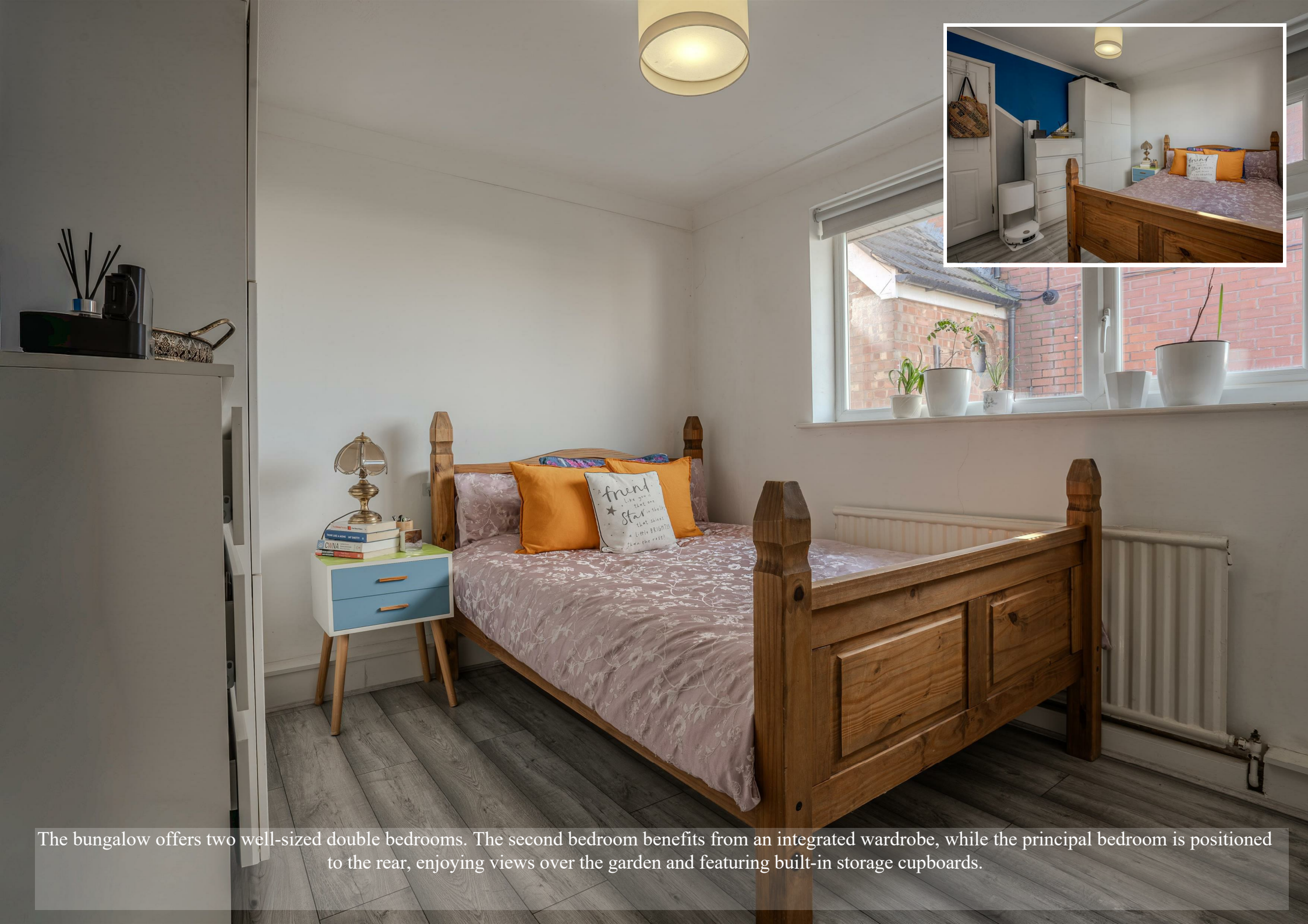
The bungalow offers two well-sized double bedrooms. The second bedroom benefits from an integrated wardrobe, while the principal bedroom is positioned to the rear, enjoying views over the garden and featuring built-in storage cupboards.