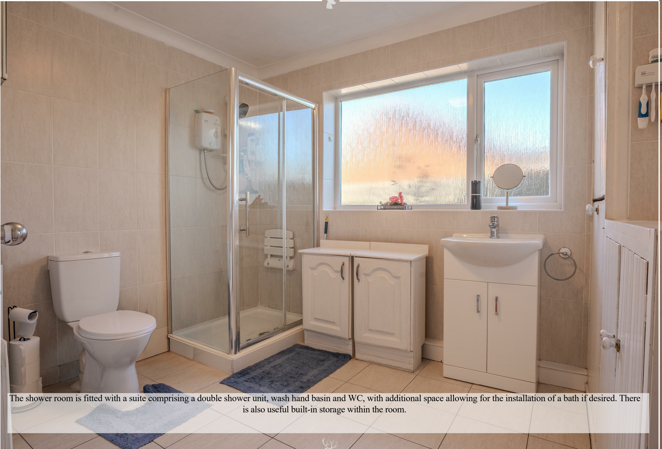
The shower room is fitted with a suite comprising a double shower unit, wash hand basin and WC, with additional space allowing for the installation of a bath if desired. There is also useful built-in storage within the room.