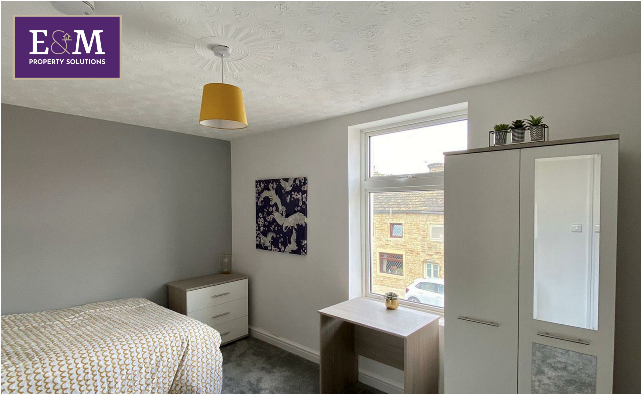
Room 2, 837 Briercliffe Road, Burnley, Lancashire, BB10 2HA £100 Per week