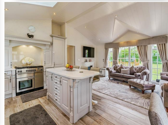
Laburnum Court, Smallfield Horley RH6 9QB