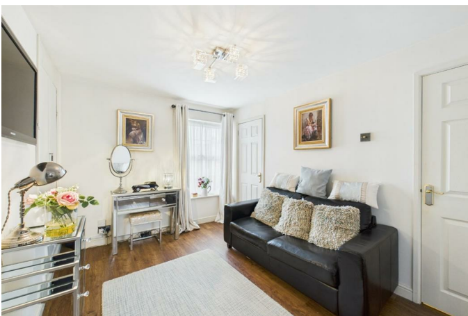
Bedroom 12'1" x 8'9" (3.69 x 2.67)

With a door leading from the landing, a door leading to the en-suite, built in wardrobe storage, a double