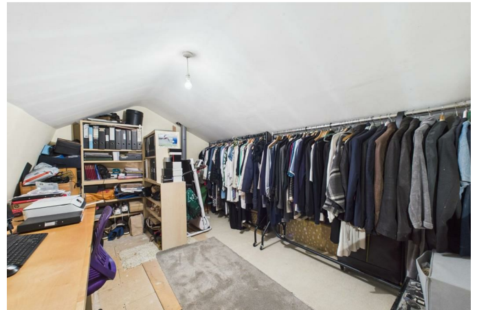
Loft Room 10'2" x 16'2" (3.11 x 4.94)

With stairs leading from the landing, eaves storage