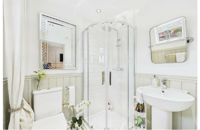
En-Suite 5'10" x 5'3" (1.79 x 1.61)

With a door leading from the bedroom, half height panelling throughout, WC, hand wash basin, a corner shower cubicle with full height tile surround and mixer shower, a double glazed window to the rear and a central heating radiator