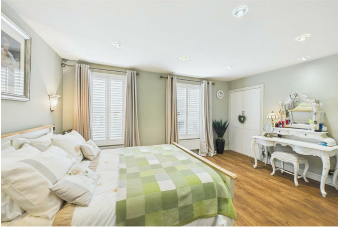
Bedroom 11'5" x 14'9" (3.48 x 4.51)

With a door leading from the landing, a door leading to the 'Jack & Jill' bathroom, built in wardrobe storage, double glazed windows to the front with traditional style shutters and a central heating radiator