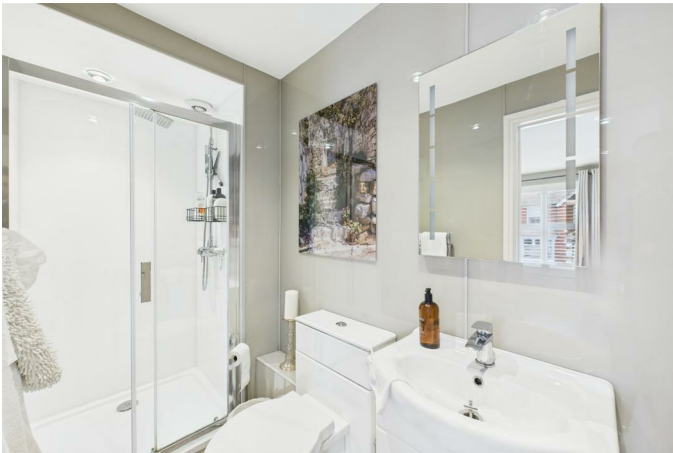
Jack & Jill Family Bathroom 4'1" x 9'7" (1.26 x 2.94)

With doors leading from the landing and the bedroom, full height panel surround, WC, hand wash basin, walk in shower cubicle with glass screen and a central heating radiator