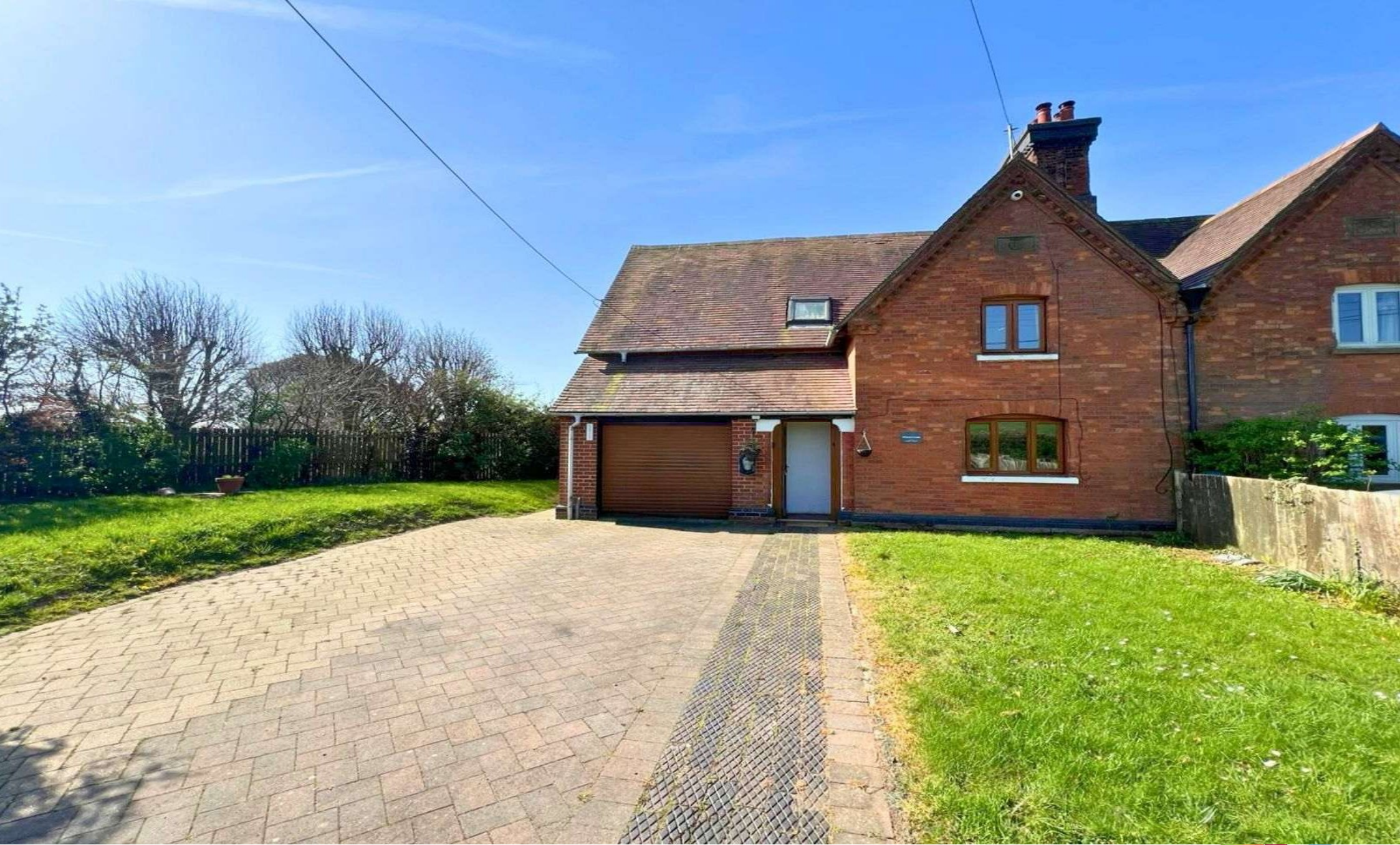
Pickles Close Upper Pollicott, Ashendon Aylesbury HP18 0HH