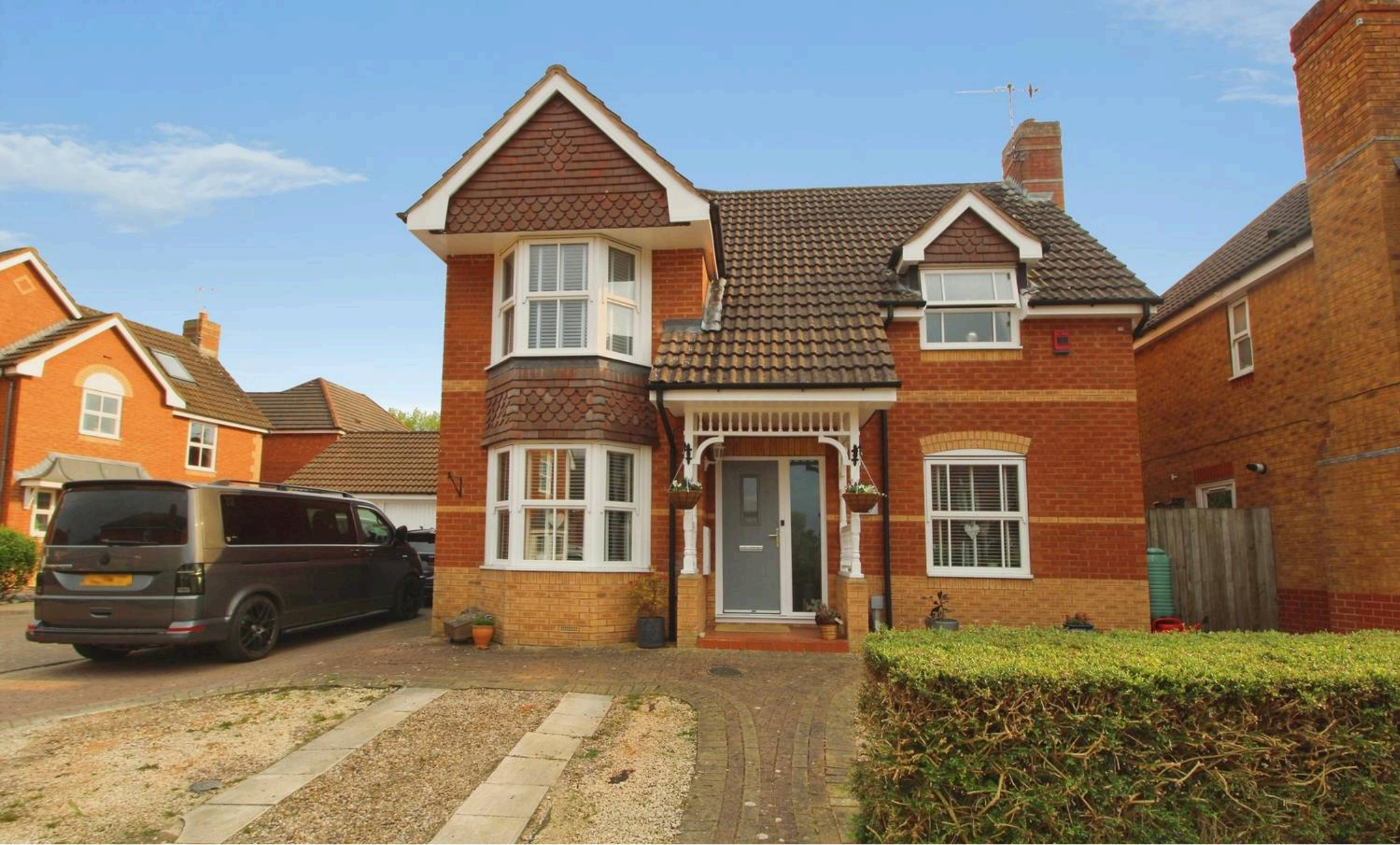
29 Cranborne Chase Swindon