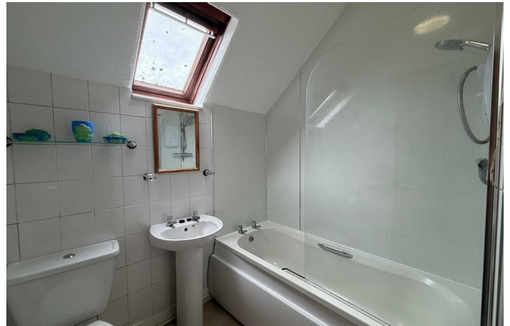
TOP FLOOR 1033 sq.ft. (96.0 sq.m.) approx.