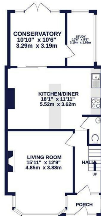
GROUND FLOOR 657 sq.ft. (61.1 sq.m.) approx.