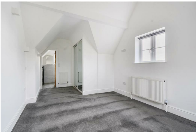
Bedroom One 22'4 x 10'6 (6.81m x 3.20m)