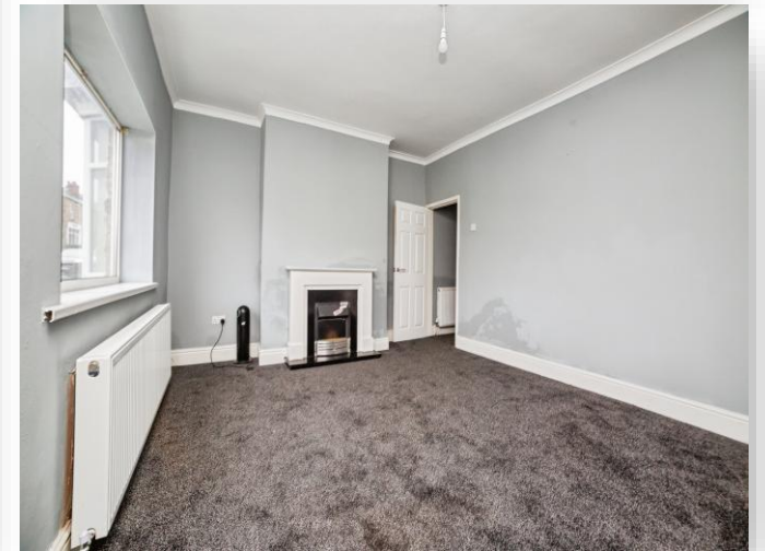
Wath Road, Mexborough S64 9RQ