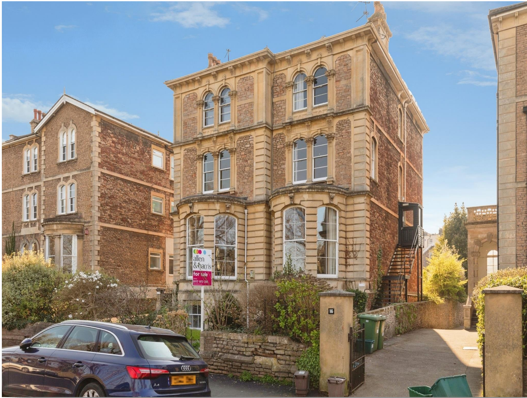
College Road, Clifton Bristol BS8 3HZ