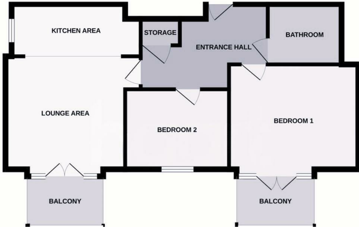
SECOND FLOOR FLAT

Whilst every attempt has been made to ensure the accuracy of the floorplan contained here, measurements of doors, windows, rooms and any other items are approximate and no responsibility is taken for any error, omission or mis-statement. This plan is for illustrative purposes only and should be used as such by any prospective purchaser. The services, systems and appliances shown have not been tested and no guarantee as to their operability or efficiency can be given. Made with Metropix ©2024