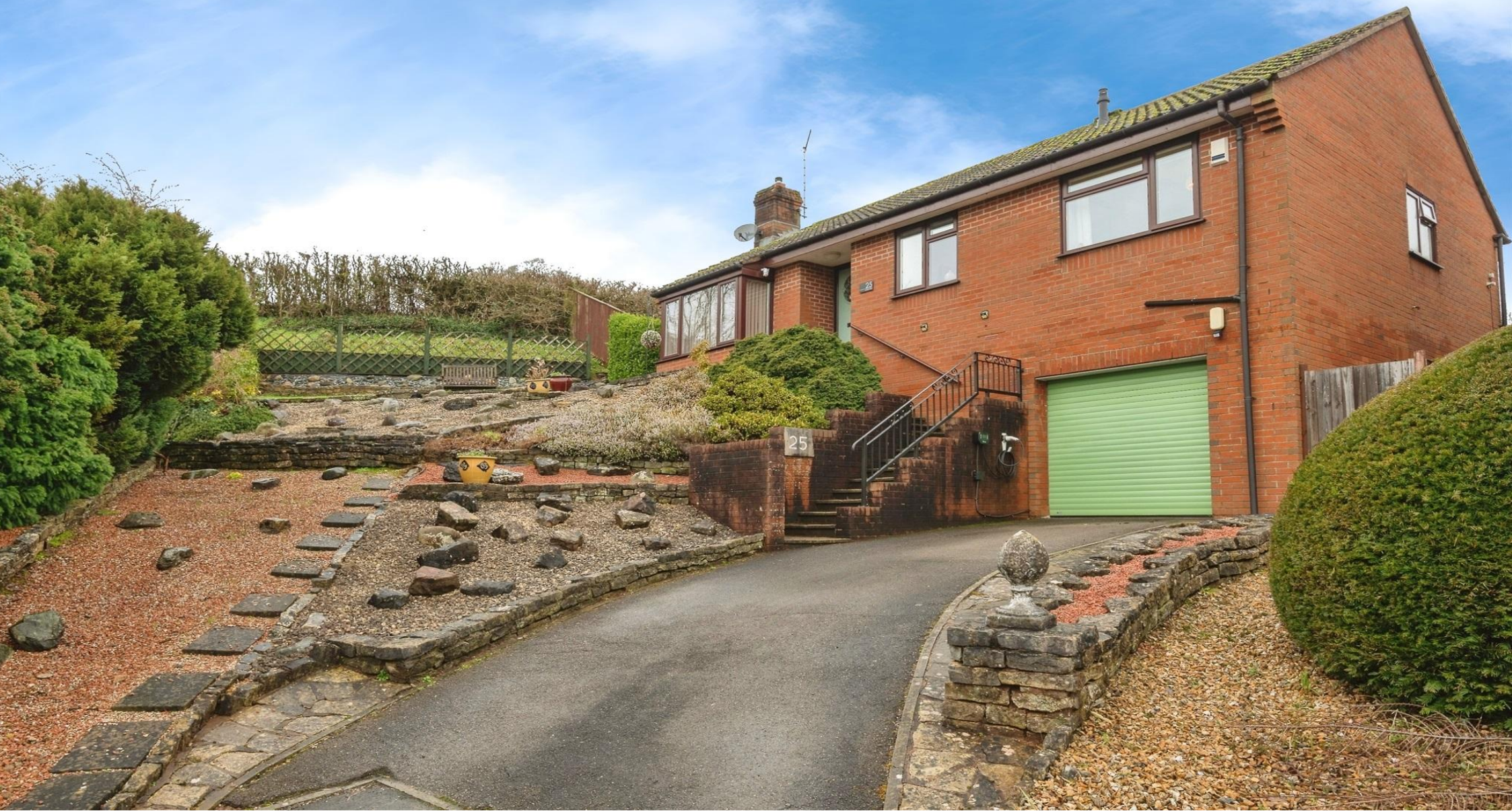
Ashley Rise, Ashley Tiverton EX16 5PW