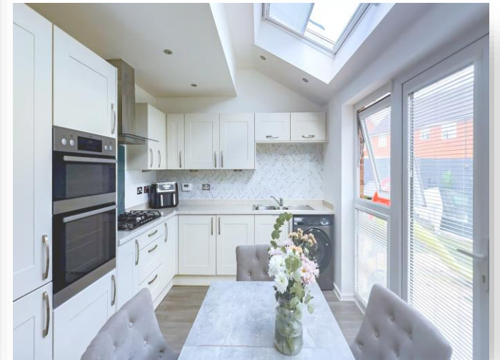
Carson Avenue, Ellesmere Port CH65 4FA