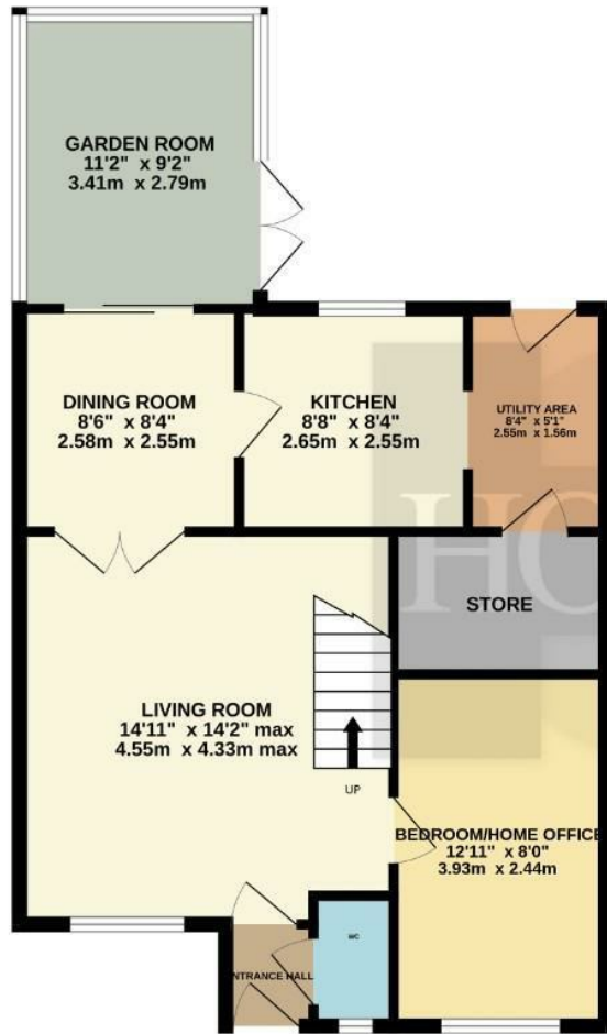
GROUND FLOOR 681 sq.ft. (63.3 sq.m.) approx.