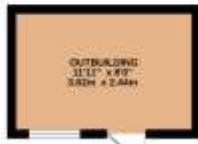
OUTBUILDING TOTAL AREA: 1111 sq.m. approx.