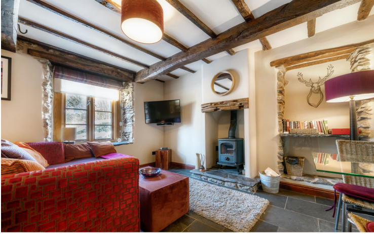
Open Plan Living Room