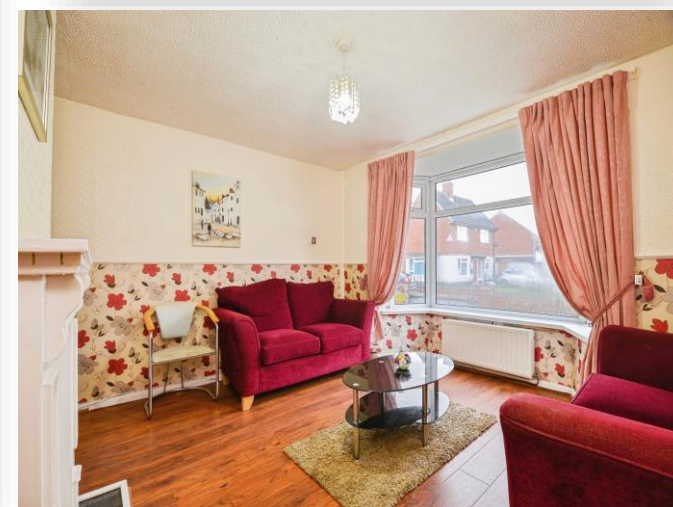
Dinsdale Road, Stockton-On-Tees TS19 8NB