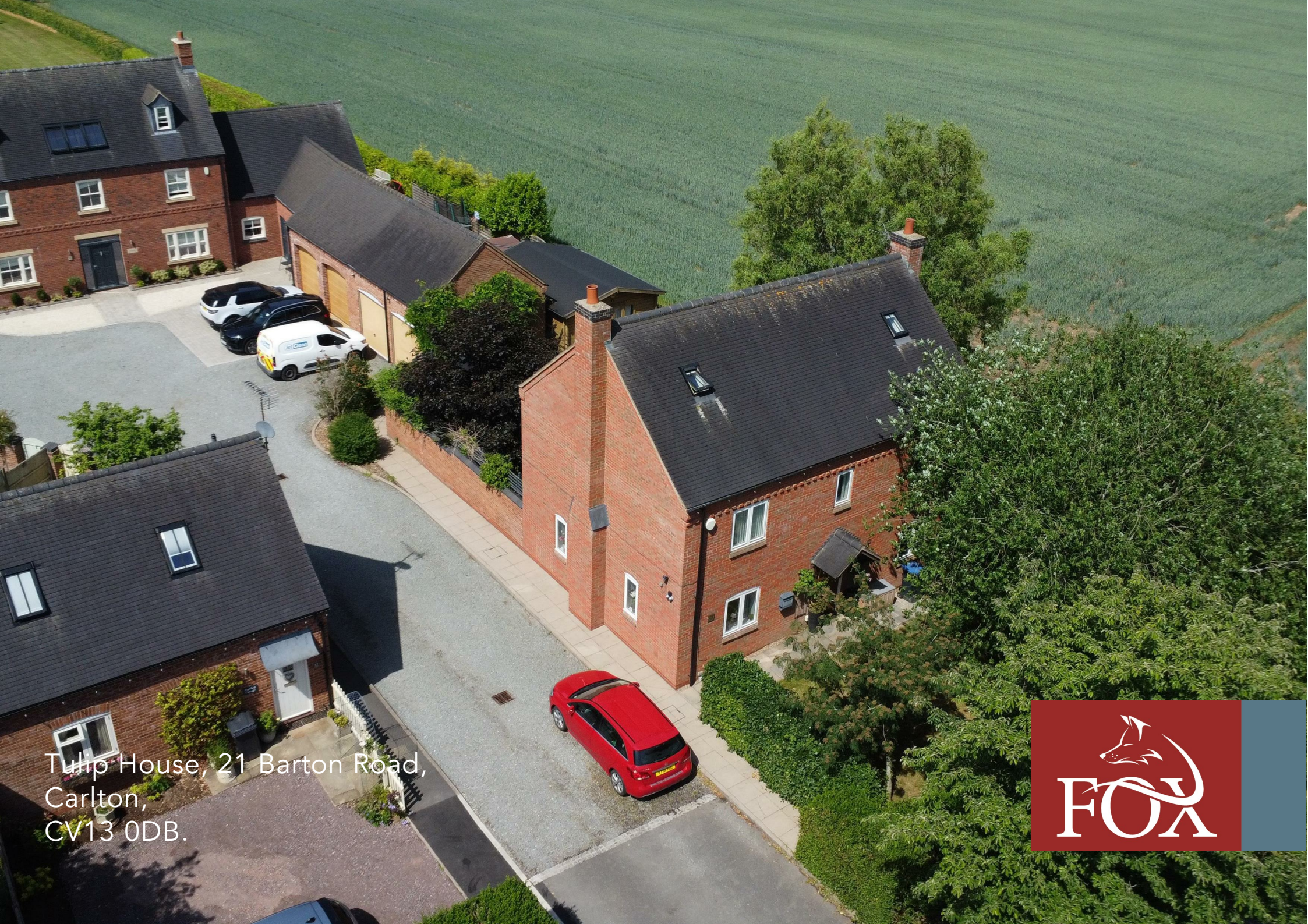
Tulip House, 21 Barton Road, Carlton, CV13 0DB.