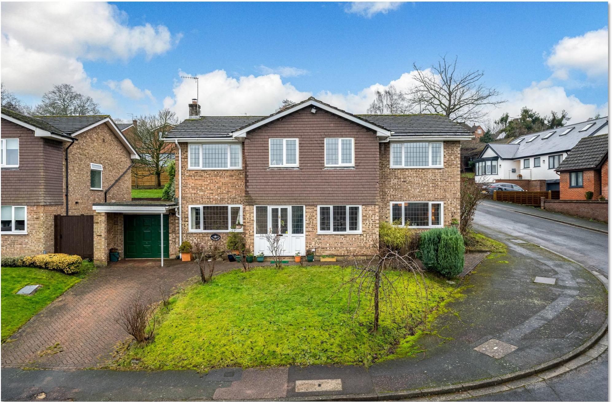
Fieldway, Berkhamsted HP4 2NY