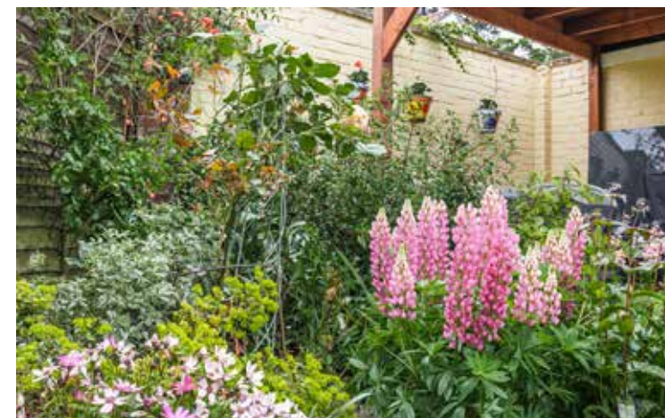
Garden in Bloom

“The landscaped garden provides a private haven, perfect for al fresco dining or simply enjoying the seasons.”