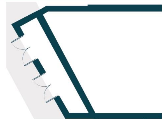
BASEMENT - BOAT STORE