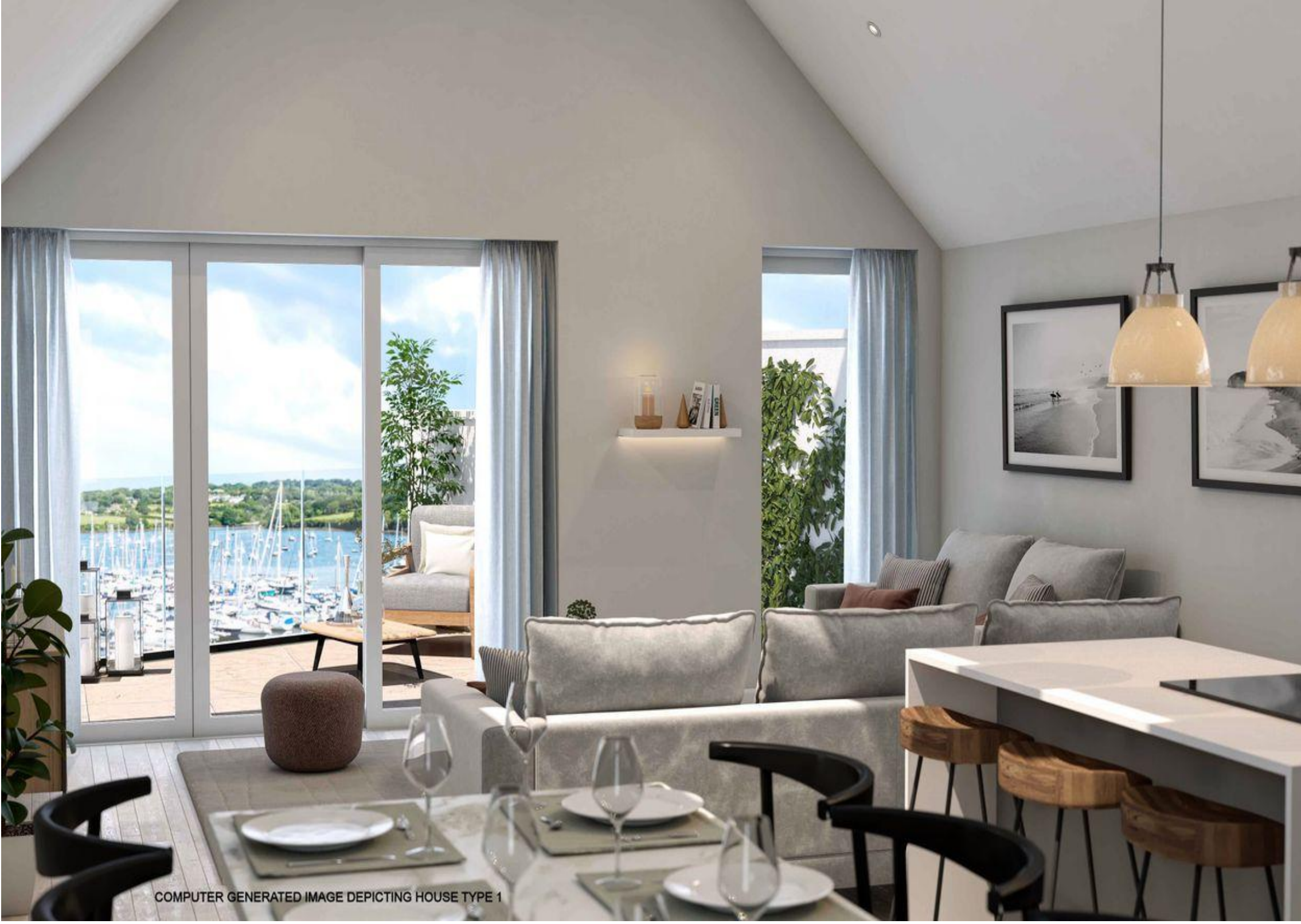
COMPUTER GENERATED IMAGE DEPICTING HOUSE TYPE 1