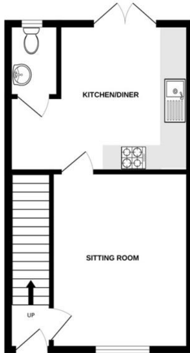
GROUND FLOOR 371 sq.ft. (34.5 sq.m.) approx.